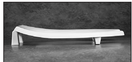
ADDITIONAL 2" OF HEIGHT