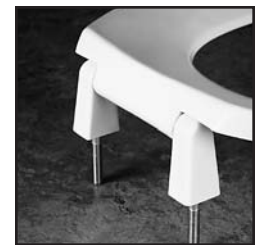
300 SERIES STAINLESS STEEL HINGES